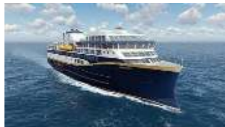
Havila Kystruten 2022