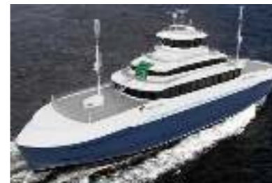
Fiskerstrand Yard Ferry 2020 ?