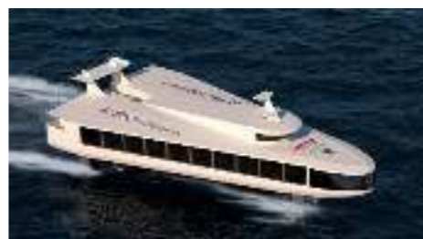
Trøndelag Fast Ferry 2021 ?