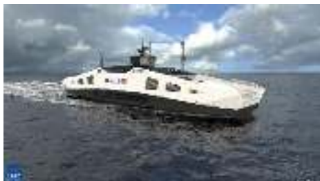
NORLED ferry 2021