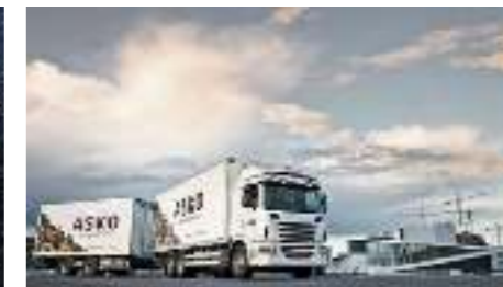
Scania Trucks ASKO 2019